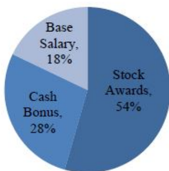
2020 Chief Executive Officer Total Direct Compensation Mix