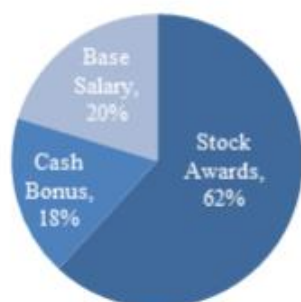
2018 Chief Executive Officer Total Direct Compensation Mix